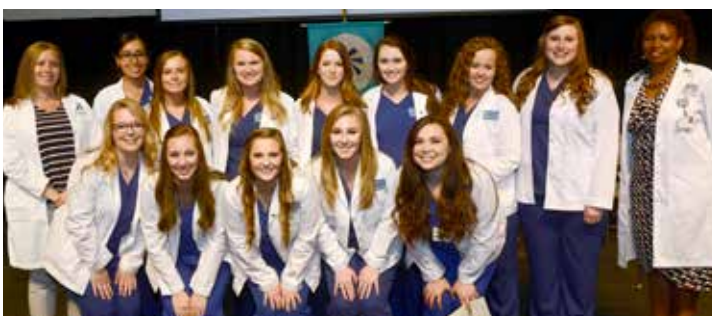
Diagnostic Medical Sonography

Twelve Diagnostic Medical Sonography students; seven Medical Laboratory Science students; 20 Medical Radiography students; six Nuclear Medicine Technology students; six Radiation Therapy students; and five Respiratory Care students.