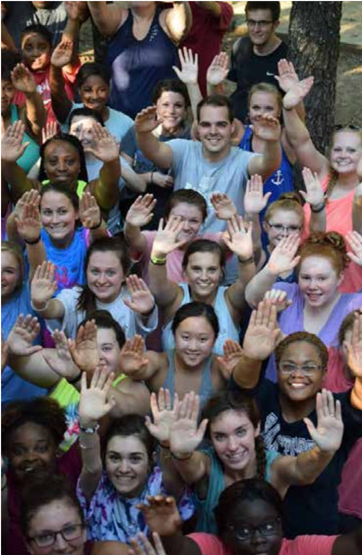
Camp Bear Track - Student Retreat