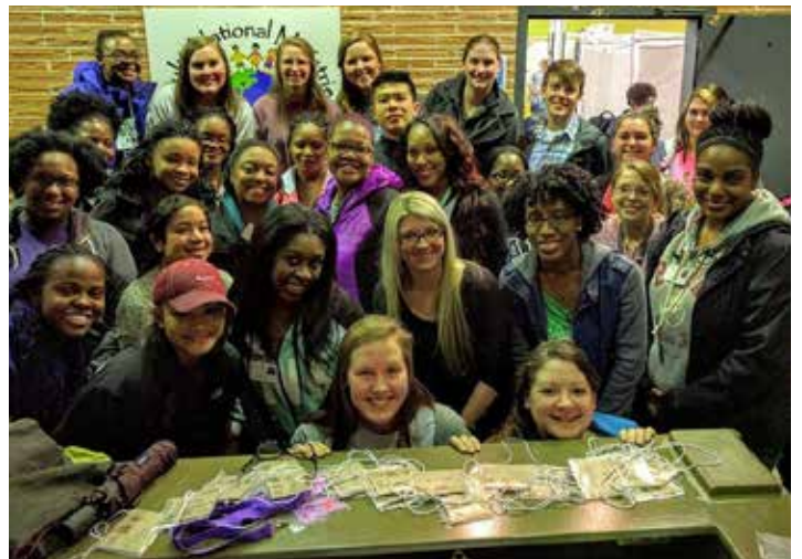
Day of Service - Multinational Ministries