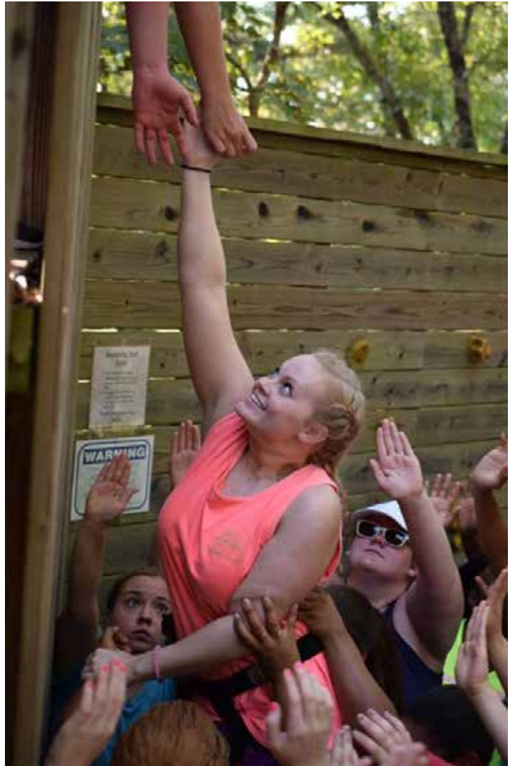
Camp Bear Track - Student Retreat