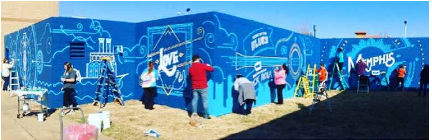
Above: Students, Faculty and staff painting the campus I Love Memphis mural. The mural was painted as part of the annual Spiritual Renewal Week. This years' theme was Praying in Color - Expressions of Prayer.