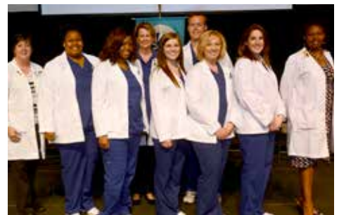
Nuclear Medicine Technology