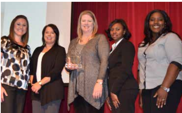
Baptist College team wins the 1st annual Inter-Professional Health Care Case Study Challenge against Christian Brothers University.