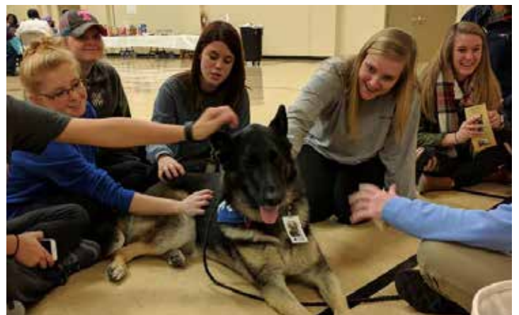
Stress Free Zone