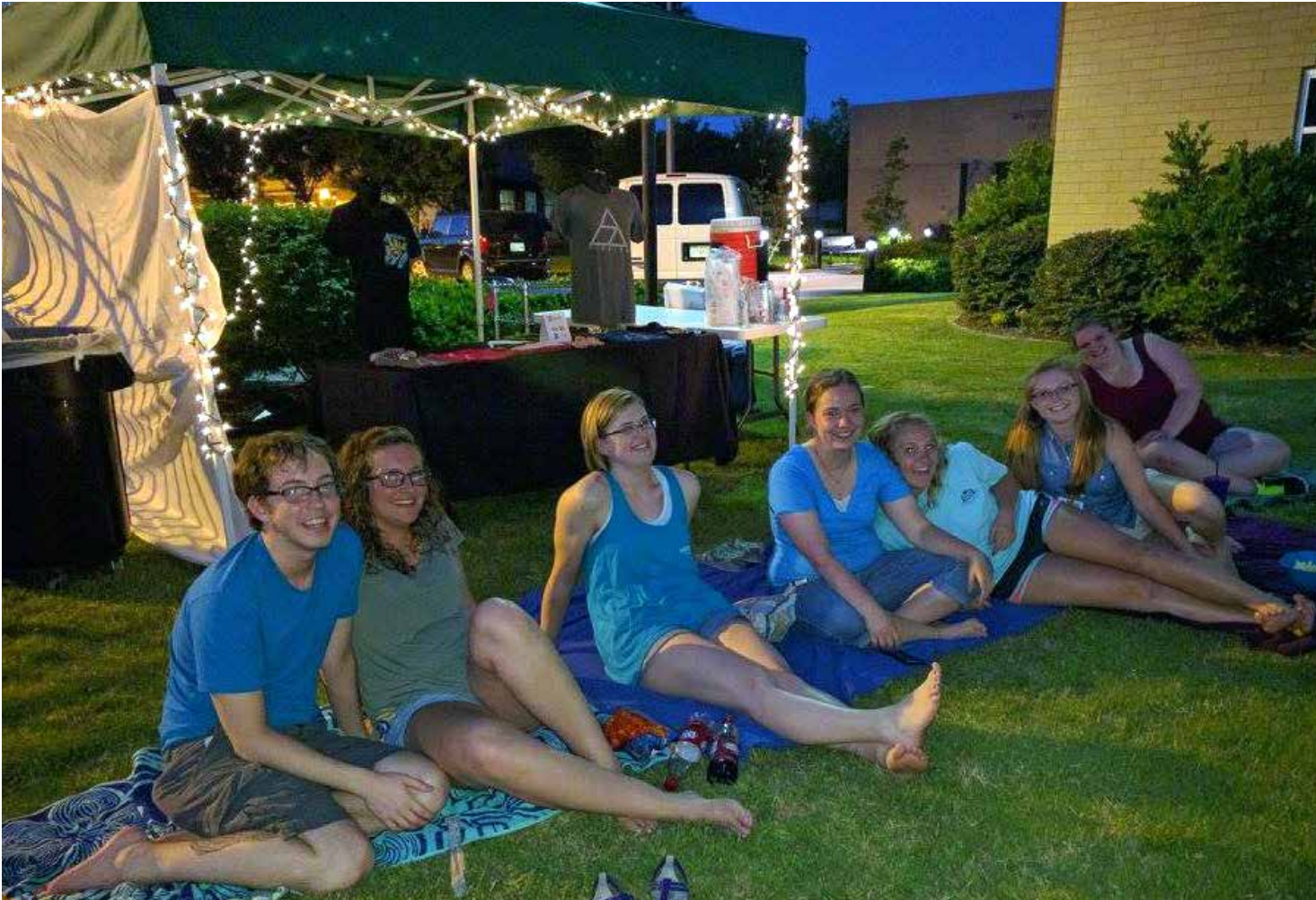
Concert on the lawn