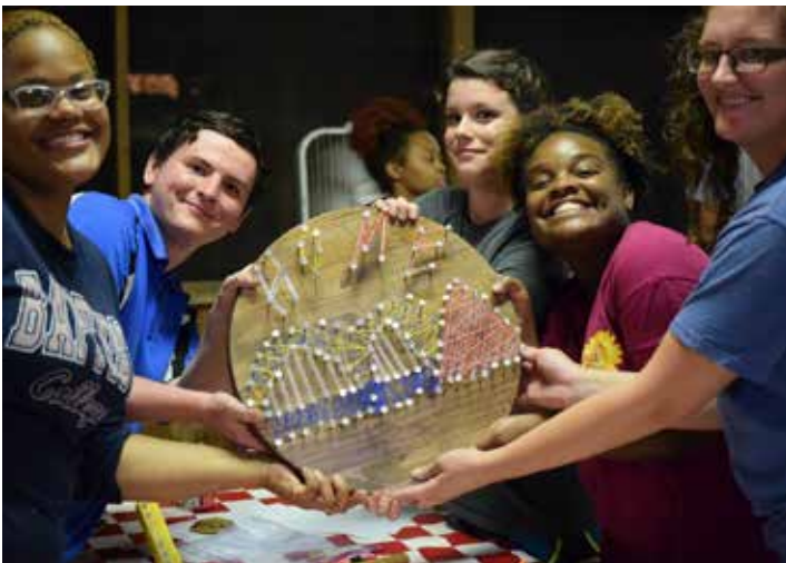
Camp Bear Track - Student Retreat