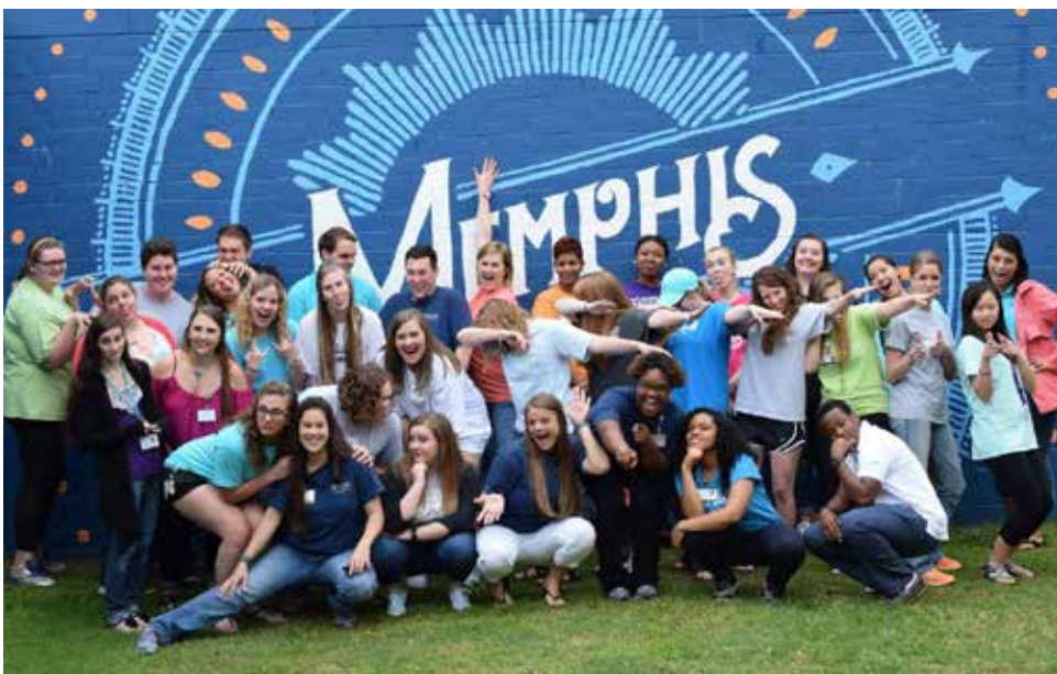
Left: Student Leaders Retreat