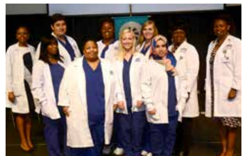
Medical Laboratory Sciences