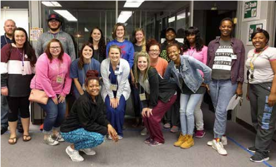
Day of Service - Multinational Ministries