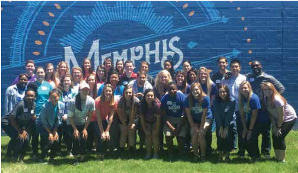
Student Leaders Retreat - May 2, 2017