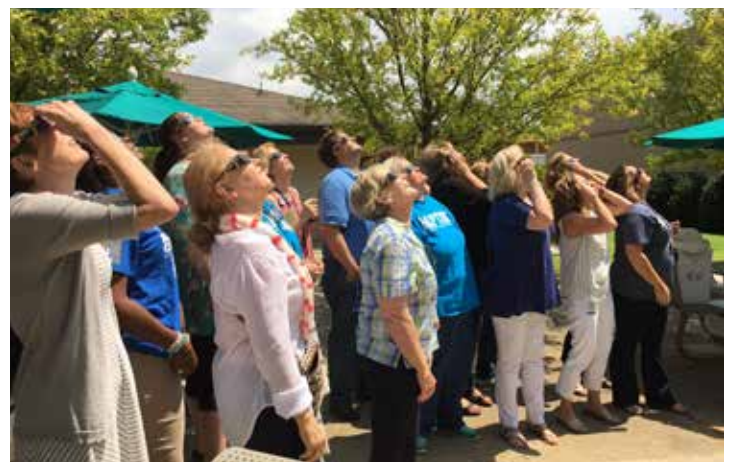
Baptist College hosted a Solar Eclipse Party on August 21, 2017.