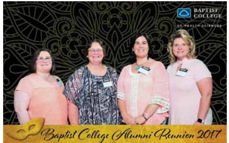
Class of 1992, celebrating 25 years