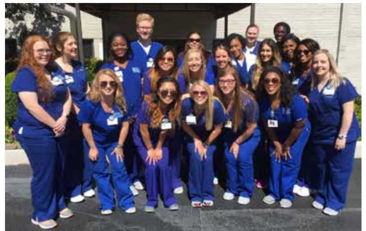
Medical Radiography students at MERI