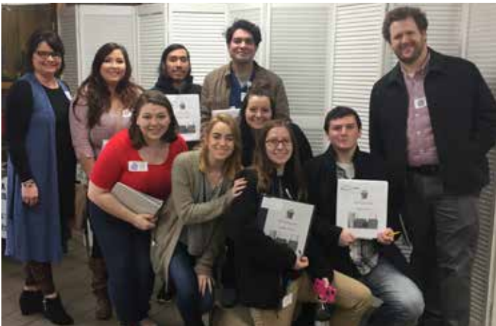
Faculty, staff and students participating as judges at the Magnolia Heights School science fair.