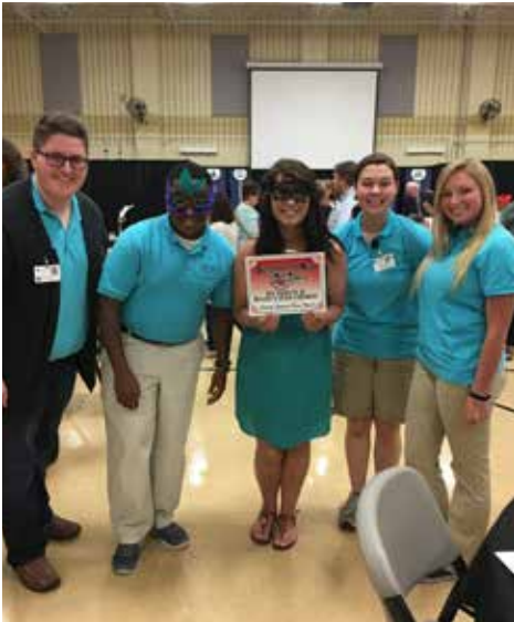
Presidential Ambassadors solve the crime at the Murder Mystery Dinner.