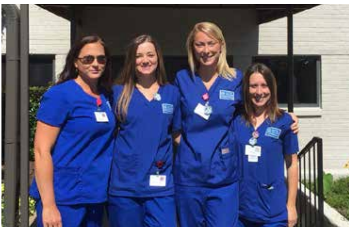
Radiation Therapy students at MERI