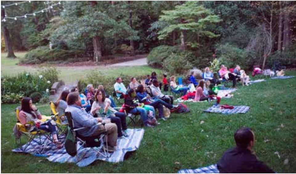
The Alumni Fall Homecoming, held on October 13, 2017, included a movie and picnic on the lawn.