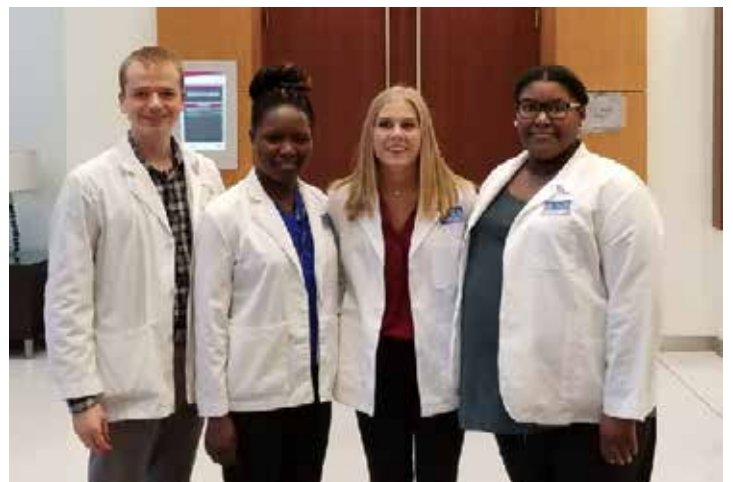
Respiratory Care senior students presenting CQI: A Concurrent Study of the Application of Mechanical Ventilator Alarm Settings at the West Tennessee Chapter for Respiratory Care Seminar.