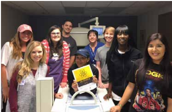
Nuclear Medicine juniors during Nuclear Medicine Week