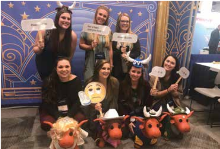
Diagnostic Medical Sonography students attending the annual SDMS conference.