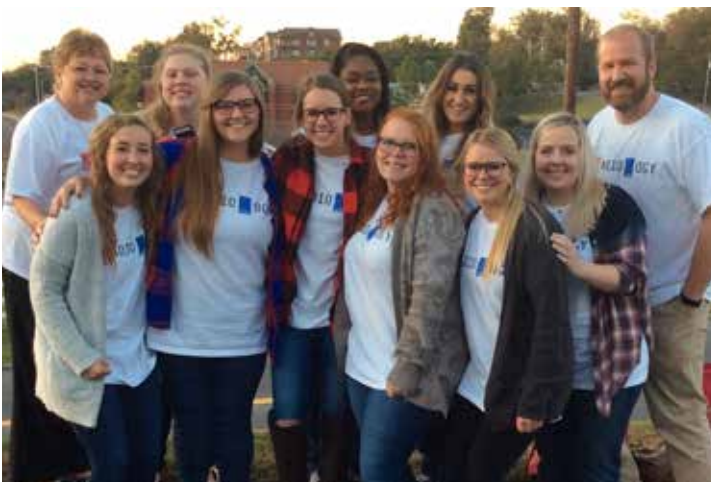
Medical radiography students at the annual TSRT conference.