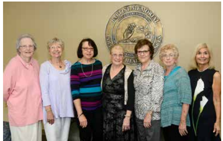
Class of 1967, celebrating 50 years