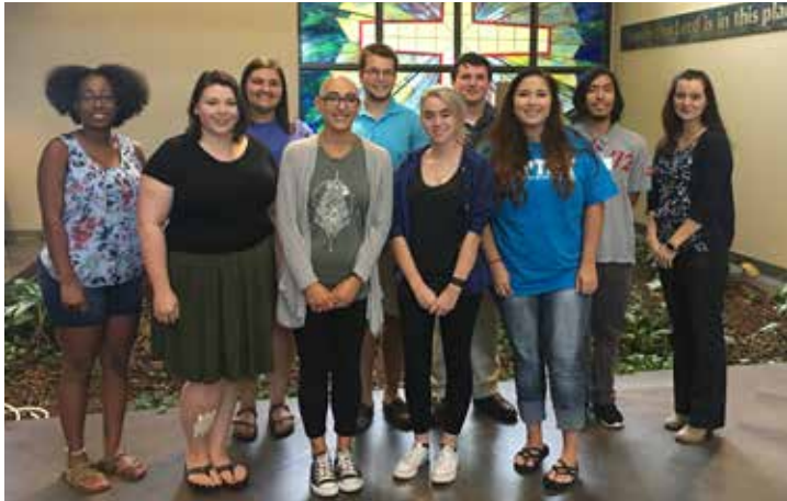
The American Chemical Society is a new student organization on campus.