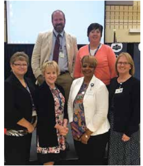
Allied Health faculty at the 2017 Quest Symposium.