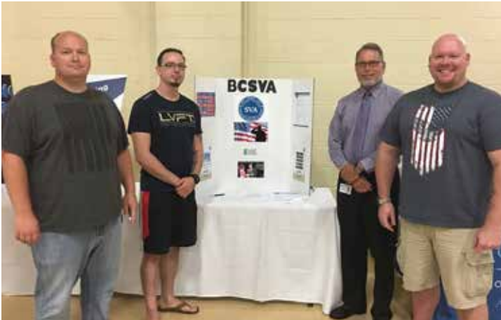
The Baptist College Student Veteran's Association is a new student organization on campus.