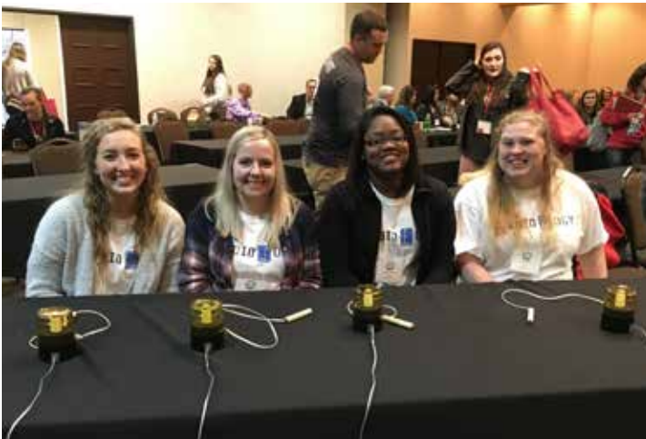
Medical radiography students attending the annual TSRT conference.