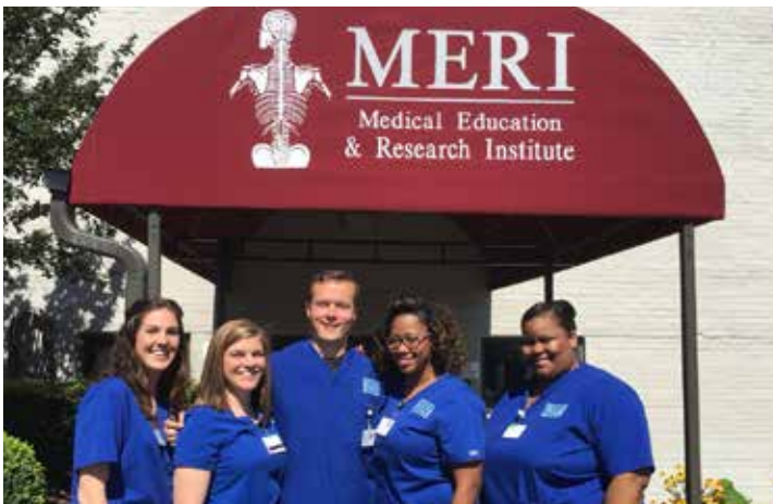
Nuclear Medicine students at MERI