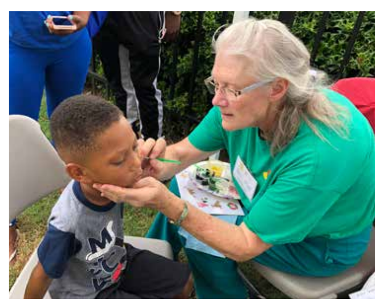
ABOVE and LEFT: Family Day