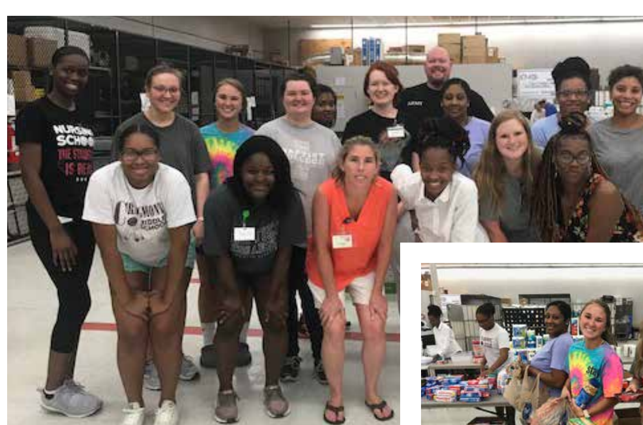
ABOVE and RIGHT: ProjectPackage