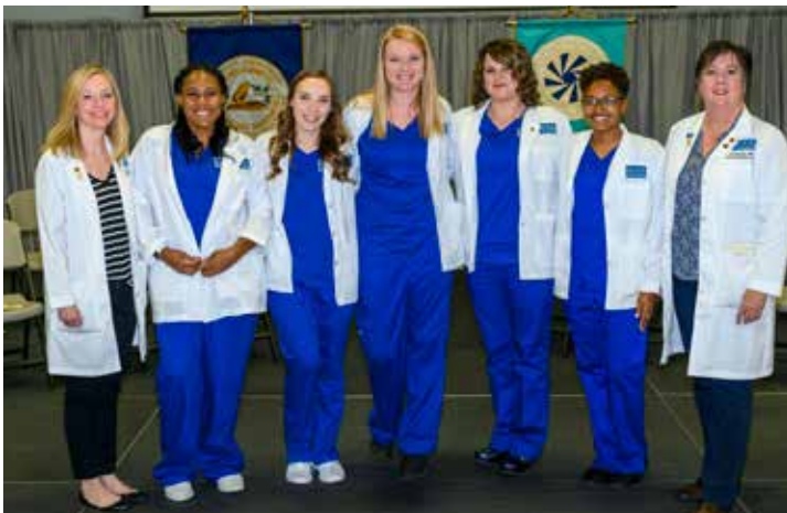
Nuclear Medicine Technology