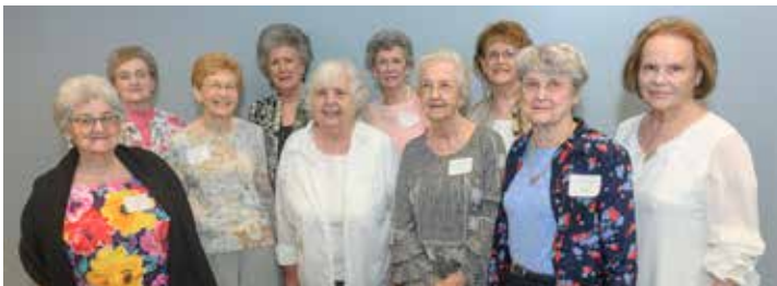
Nursing, class of 1957