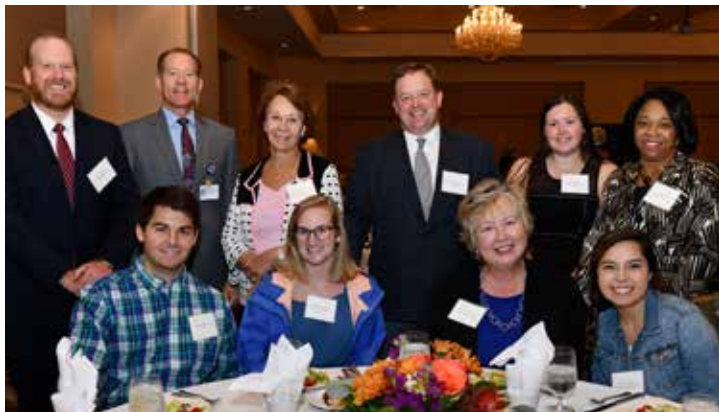
Baptist Memorial Health Care and Baptist College colleagues pictured with student scholarship recipients.