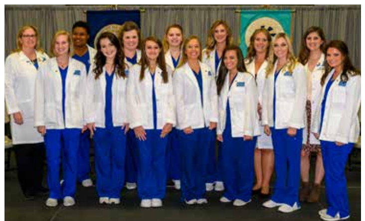
Diagnostic Medical Sonography