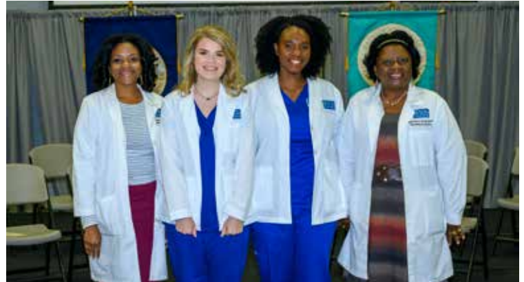
Medical Laboratory Science