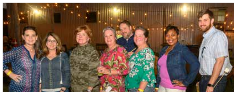
Alumni Board of Directors at the Loflin yard event