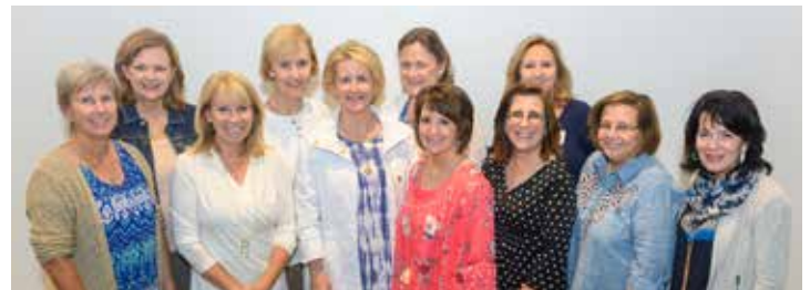
Nursing class of 1994 celebrating 25 years