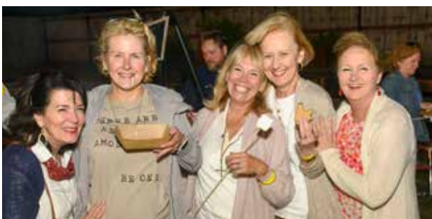
Nursing class of 1994 celebrating 25 years