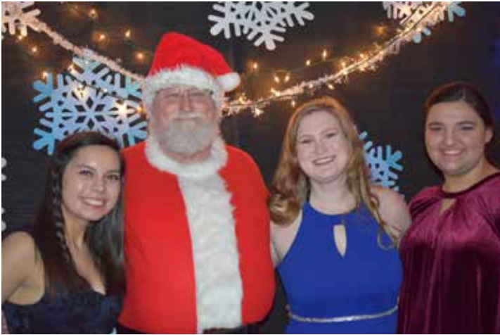
Snow Ball 2018