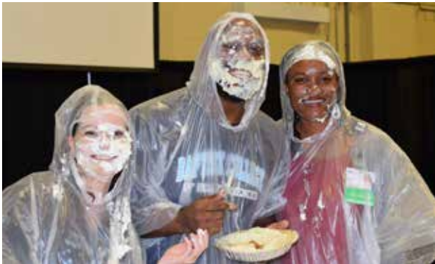
Stress Free Zone