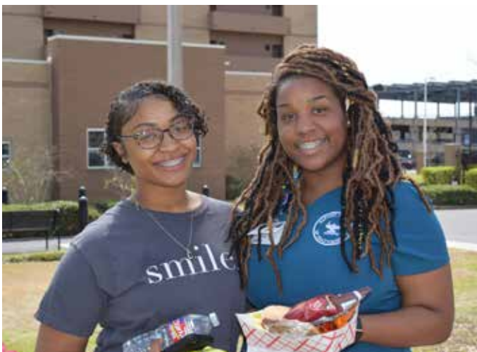
Heart Health Spring Fling