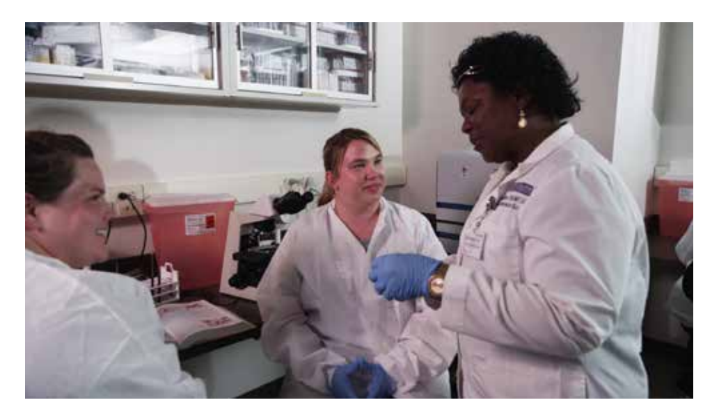
THE BAPTIST COLLEGE OF HEALTH SCIENCES MEDICAL LABORATORY Science Program recently received the Certificate of Accreditation from the National Accrediting Agency for Clinical Laboratory Sciences. According to the NAACLS Guide to Accreditation, it is a process of external peer review

in which an agency grants public recognition to a program of study or an institution that meets established qualifications and educational standards.