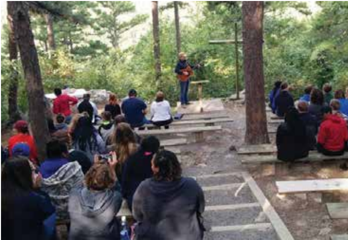
ABOVE: The student retreat at Camp Bear Track ended with worship time and a mountain view.