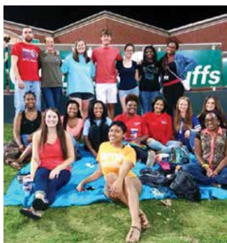
ABOVE: Students celebrate "Choose 901 Day" by exploring Memphis during Welcome Week at a Redbirds Game.