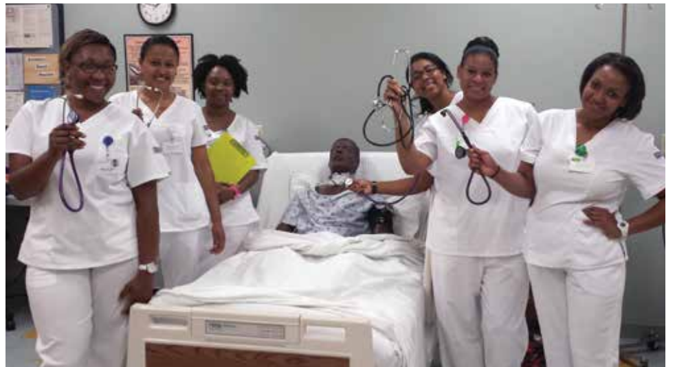
RIGHT: Student nurses showing their stethoscopes #NursesUnite #NursesShareYourStethoscopes