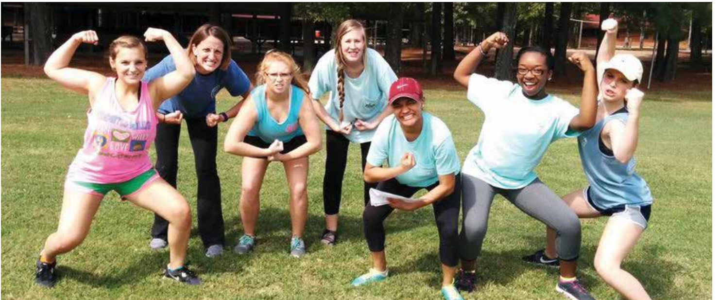
ABOVE: Students enjoying some friendly competition at this year's student retreat.