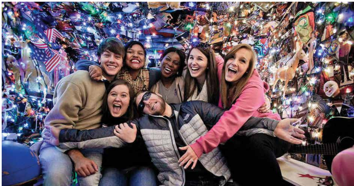
ABOVE: Members of the Student Government Association enjoying the Amurica photo booth at Family Day.