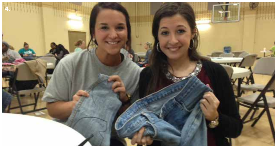
4. The Spring Mission project involved making shoes from plastic milk cartons and blue jeans. The SOLE HOPE project was held for an entire day with students staying for at least two hours. Shoes are needed for adults as well as children to help in preventing foot diseases.