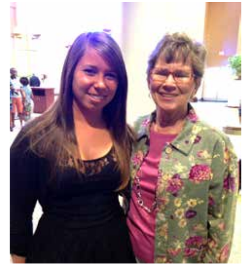
If interested in becoming a mentor please contact the Alumni Office at 901-572-2853 or email: alumni@bchs.edu .

“I have thoroughly enjoyed meeting my mentee and getting to know her better. We have become good friends even though we do not get to see each other very often. I have been heartened by her and the goals that she has set for herself. She has called a few times to ‘get my take’ on certain situations during her nursing experiences. Mainly I have listened and gave her words of encouragement and guidance, as we know each person is their own individual self and needs to make those decisions. Hopefully we can maintain this friendship over the years.”